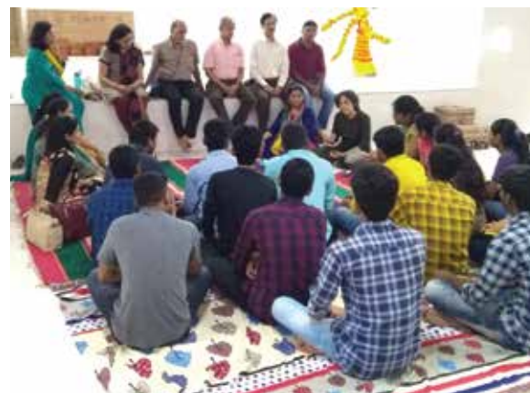
Medico Team - Monthly Meet