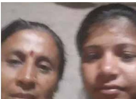
Screenshot of student with her mother

A "Google link" was provided to KPs for uploading the data collected during one to one interaction with the family.