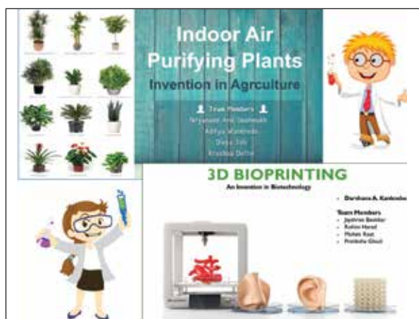
Wings of Science