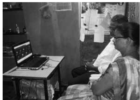
Parents attending first ever online meeting