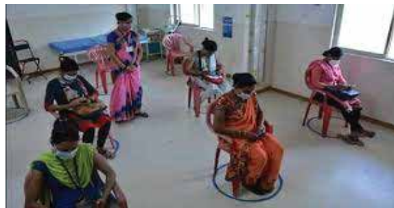
Vaccination awareness in Palak Melawa