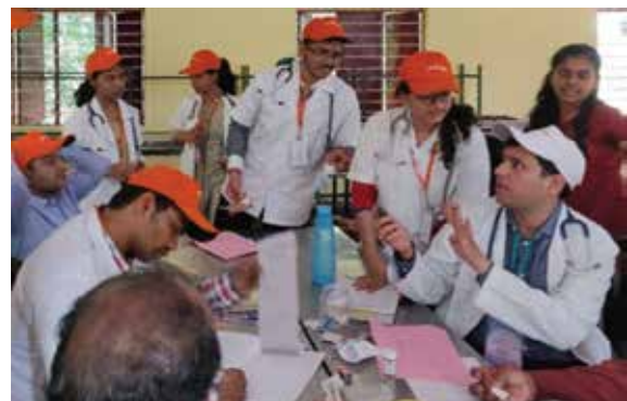
Medico Students at Sewankur Camp