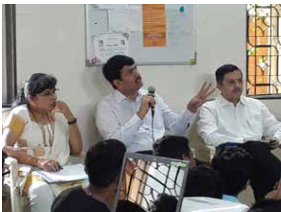
Beyond the peak Workshop Expert Panelist

In March 2020, Corona Pandemic had started playing a havoc all over the world. Adjusting to the "New Normal", all Medico