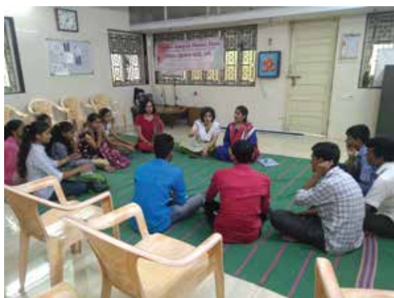
Interactive session in progress