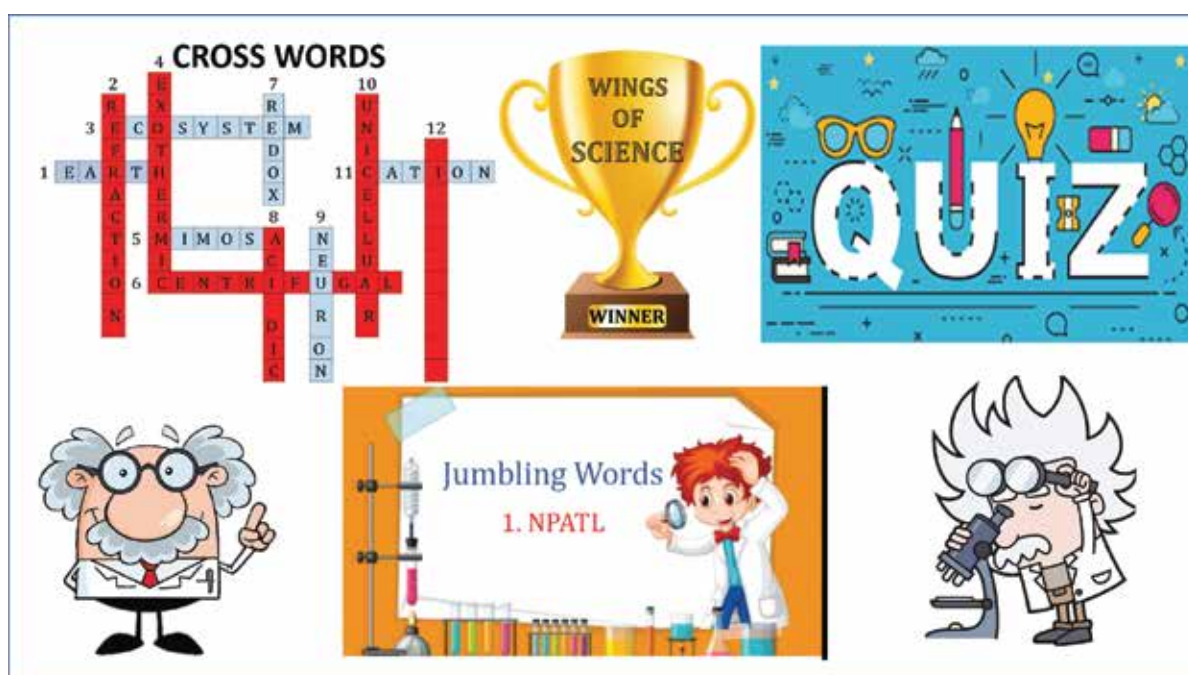
Wings of Science - Quiz

Science team helps students in planning studies and career, doubt solving, monitoring their progress, inviting experts from specific fields to share their experiences and guide & motivate the