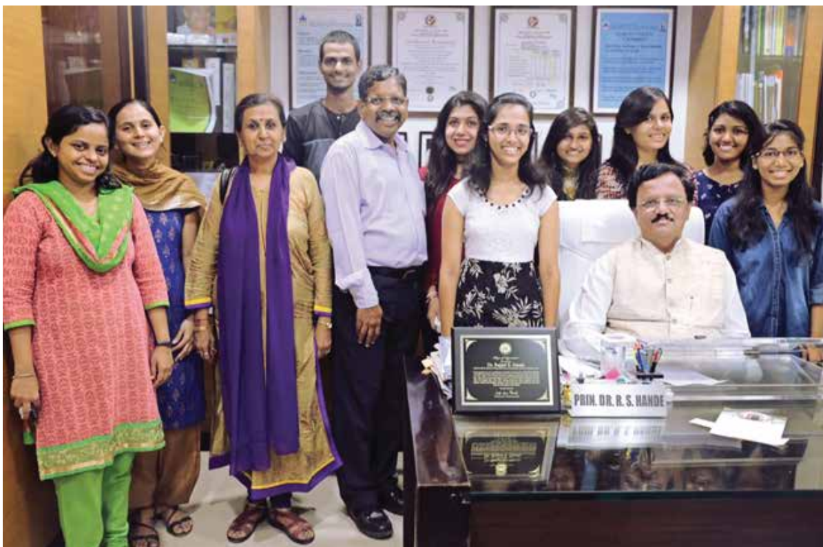
Picture with Principal of Mithibai College & others after getting 97.19 in B.Sc. Statistics