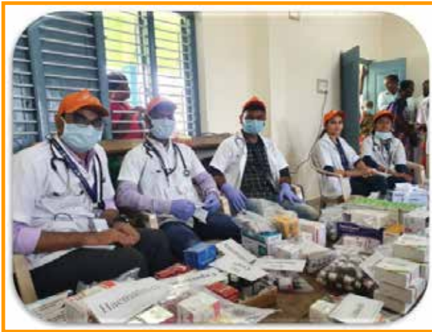
Medico Social Camp- Sevankur -One Week for Nation

The learnings of students from these camps reflected the core objective and mission of VSM to create "Empowered Students, Empowered Nation"