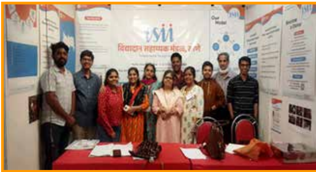
VSM Team - At Dene Samaajache Event Stall

This year VSM got an opportunity to increase its outreach through various novel platforms. With the aim of reaching out to the masses, VSM put up a stall and actively participated in the Event “Dene Samaajache” at Thane organized by Artistry Foundation, Pune in Feb. 2022.