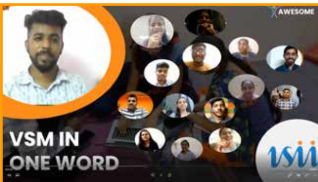
BE FRANK - VSM in One Word