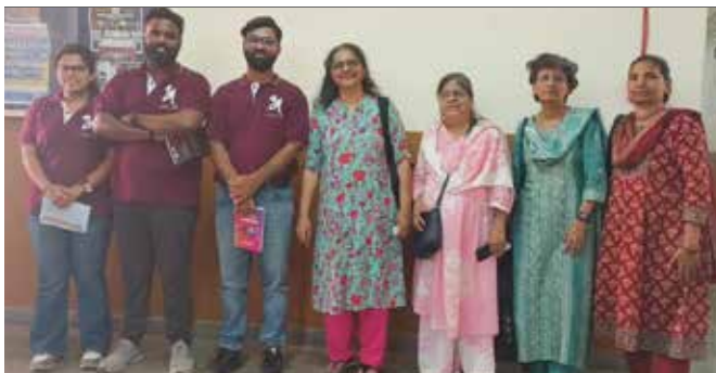
VSM Thane Team at AI Workshop in Vile Parle, Mumbai.