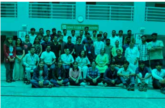
Engineering students & CG Leads at Engineering Summit at Pune.

The VSM Engineering Summit 2026, held from 24th to 26th January at Uday Gujar Foundation, Shirwal (Pune), was a dynamic three-day conclave designed to give engineering students hands-on technical exposure along with leadership and communication development. In all 50 students from all Engg branches CS, IT, Electronics, Electrical, Civil, Mechanical & Textile and from 1st yr to 4th yr actively participated in the event.