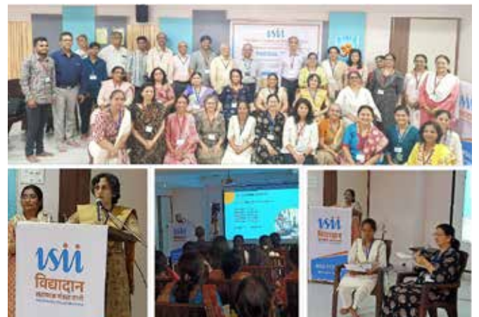
Participants, Sessions & Role Play