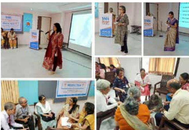
Sharing by Mentors & Case Discussion

The workshop was successful in creating awareness in mentors about many important aspects of MBBS course, understanding student problems and ways of solving them with guidance from VSM Medical team.