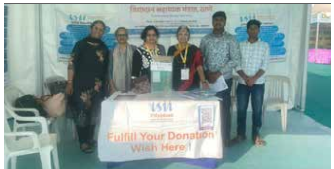
VSM Chhatrapati Sambhaji Nagar Team at their stall in Maha Expo.