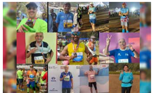
VSM's Runners participants in TMM 2026