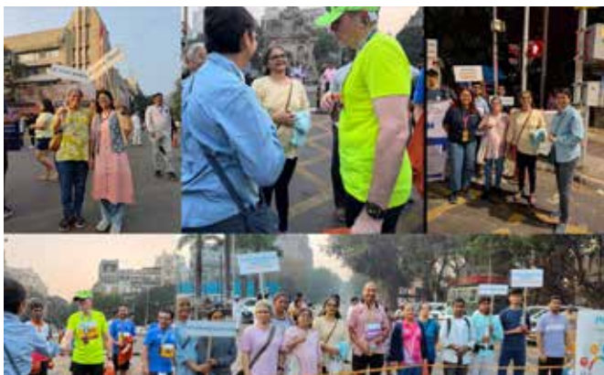
VSM Team gathers at designated corridor & meets participants.

The Tata Mumbai Marathon 2026 was a powerful celebration of purpose, community and collective action for Vidyadaan Sahayyak Mandal (VSM). As an official Charity Partner, VSM proudly participated for the first time in this iconic event, bringing together students, volunteers, runners, donors, and well-wishers to champion the transformative power of education.