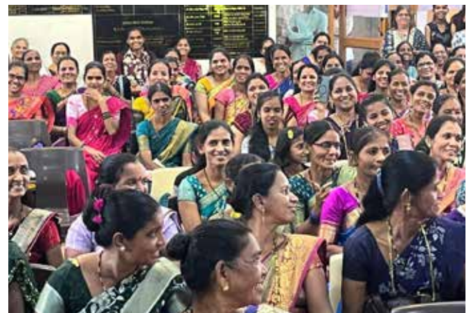
Enthusiastic participants at Women's Day at Shahapur

VSM volunteers and students took the initiative and invited women from the area, many were mothers of VSM Students. On Sunday, 8 Mar.'26, nearly 125 women gathered for this unique celebration. Instead of celebrating Women's Day through typical activities like outings, parties or competitions, this programme focused on self-awareness and discussion, making it a truly meaningful experience.