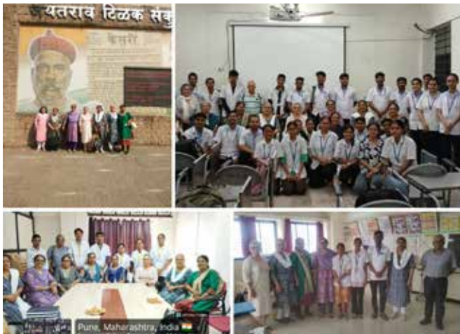
Team VSM at Tilak Maharashtra Vidyapeeth Nursing College, with BJ Nursing Students, with students of Tehmi Nursing College & S.K.Jindal College of Nursing