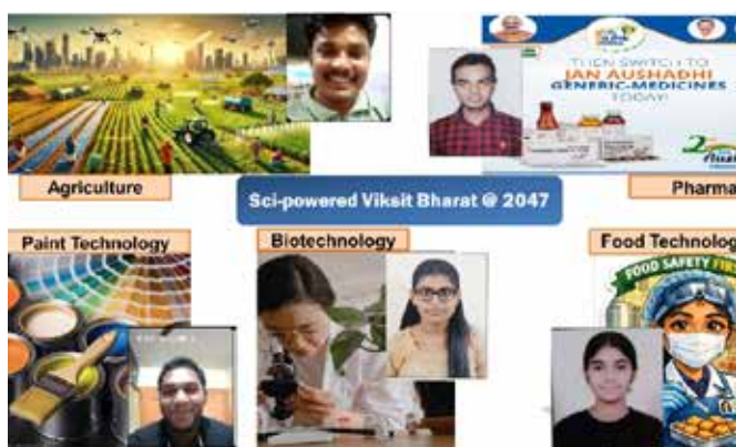
Science Team celebrates Science Day.

Science Team celebrated National Science Day on 22nd Feb.'26, with the theme “Sci-powered Viksit Bharat @ 2047”. Our Nation's mission of Viksit Bharat, 2047 is aligned with this year's National theme 'Science for sustainable future' to build self-reliant, sustainable and progressive India. Students explained the role of their specific science field in Viksit Bharat, 2047.