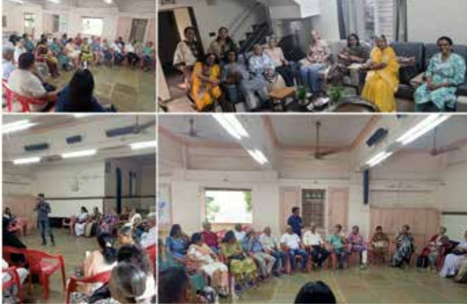
KP Din celebration at Thane & Chhatrapati Sambhaji Nagar