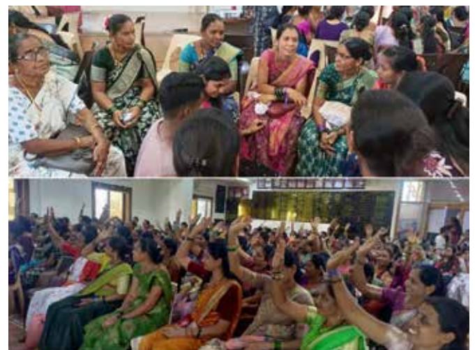
In group discussion & participating whole heartedly