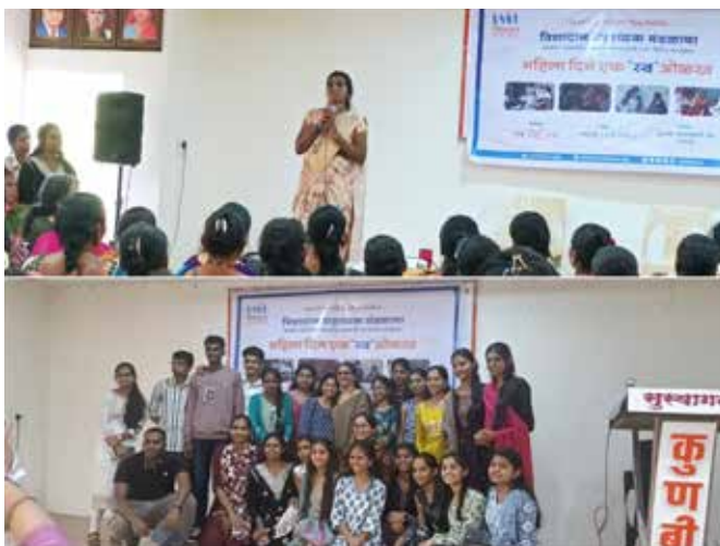
Participant expressing her thoughts and Students & Volunteers

The programme left a deep impact on everyone present. The women returned home inspired and requested more such programmes in the future.